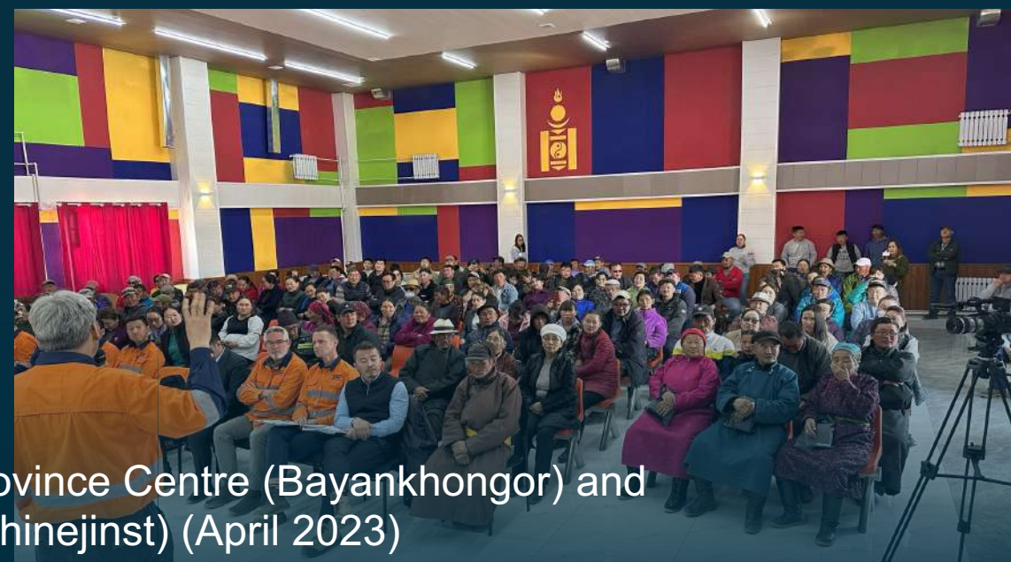
MMC & ERD CEO's Opening Representative Office in Province Centre (Bayankhongor) and Hosting an Open House Event in Sub-Province Centre (Shinejinst) (April 2023)