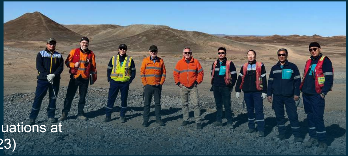
ERD Discovery Team Geologists Conduct Field Evaluations at Bayan Khundii, Dark Horse and Zuun Mod (April 2023)